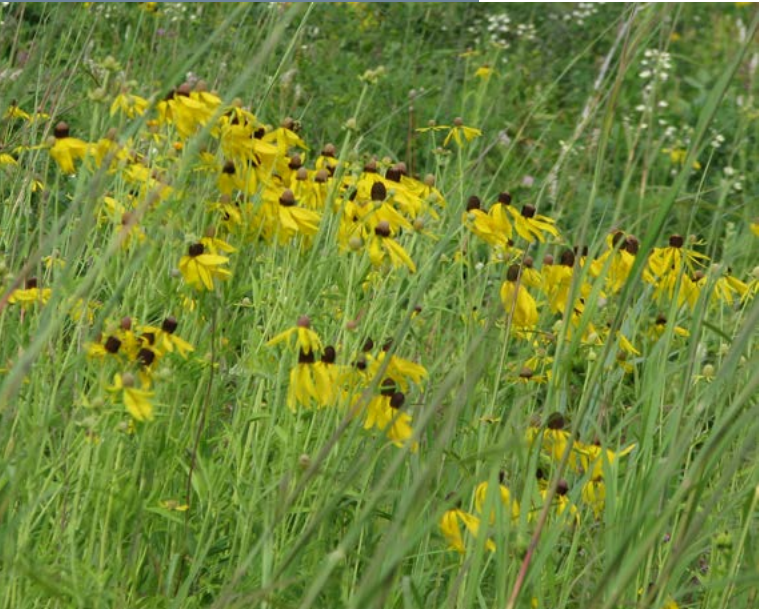
Yellow coneflowers in a summer breeze