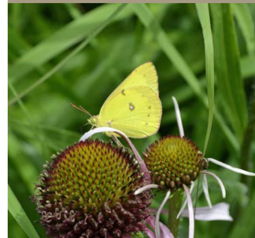
Clouded sulpher butterfly